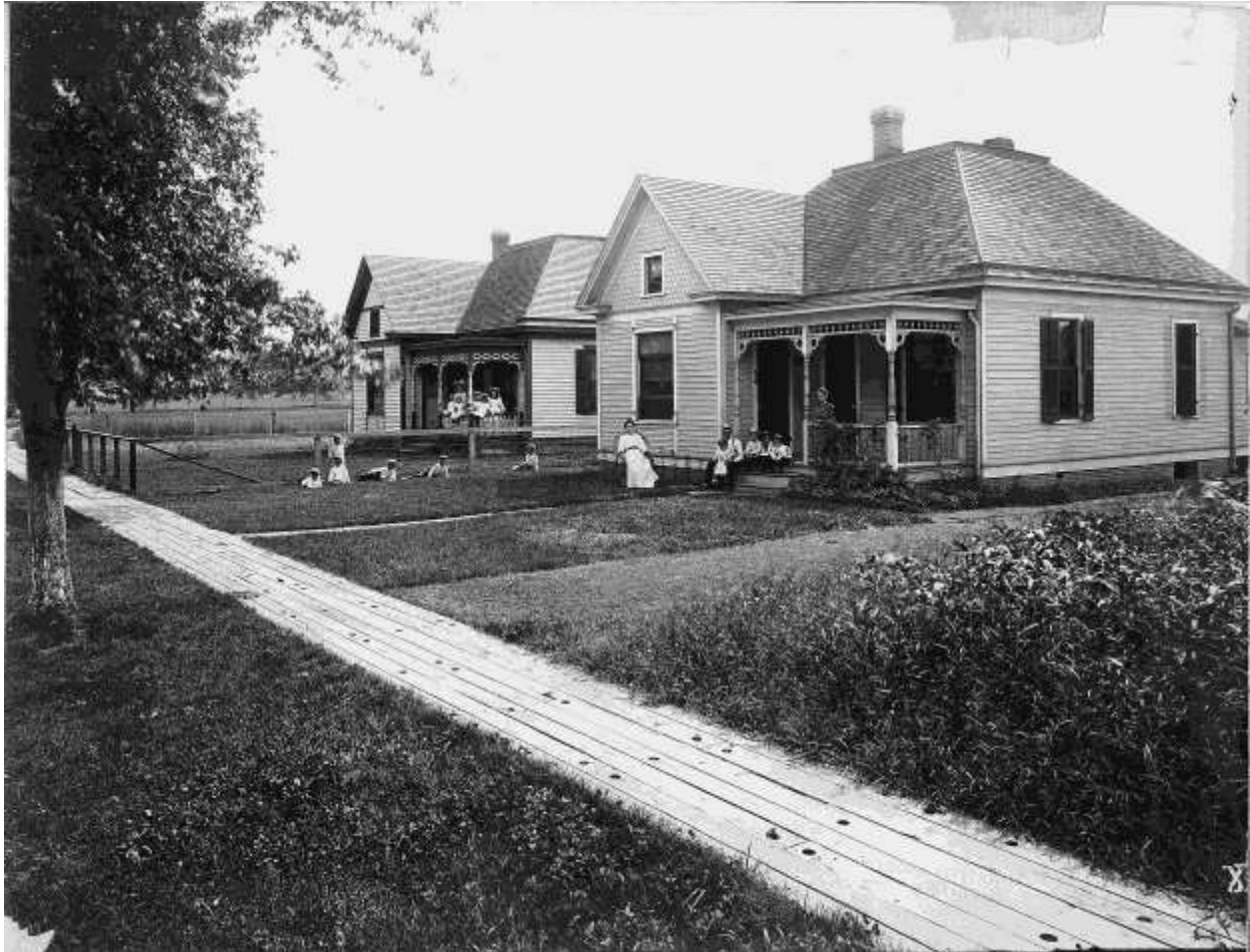
Figure 9: The house at 853 Holyoake Road, designed by architect C. D. Hill, was built in 1899. The wooden sidewalks shown here were laid out in 1890, but later replaced with “granitoid” walks.