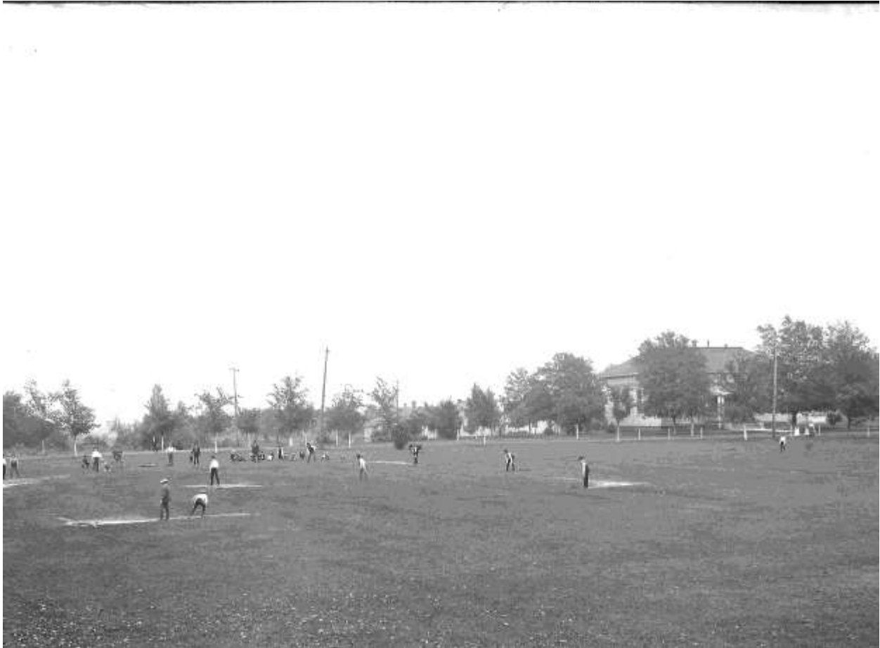
Figure 6: Weekly games of baseball were played on the field south of the N.O. Nelson Manufacturing Company factory until 1924.