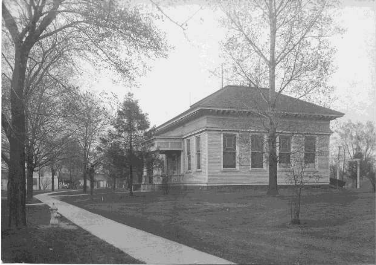
Figure 5: This undated view of the southwest side of the Leclaire School House shows the billiards hall on the left in the distance.