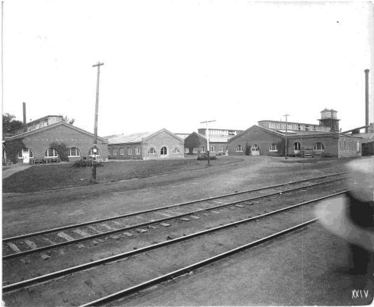
Figure 4: This photo of N. O. Nelson Manufacturing Company shows several of the factory buildings circa 1895. Nelson referred to the various industries in Leclaire as “shops”. These included the Machine Shop, Marble Shop, Brass Shop, Finishing Shop, Bath Tub Shop, Copper Shop, Finishing Shop, Cabinet Shop, and Carpenter Shop.