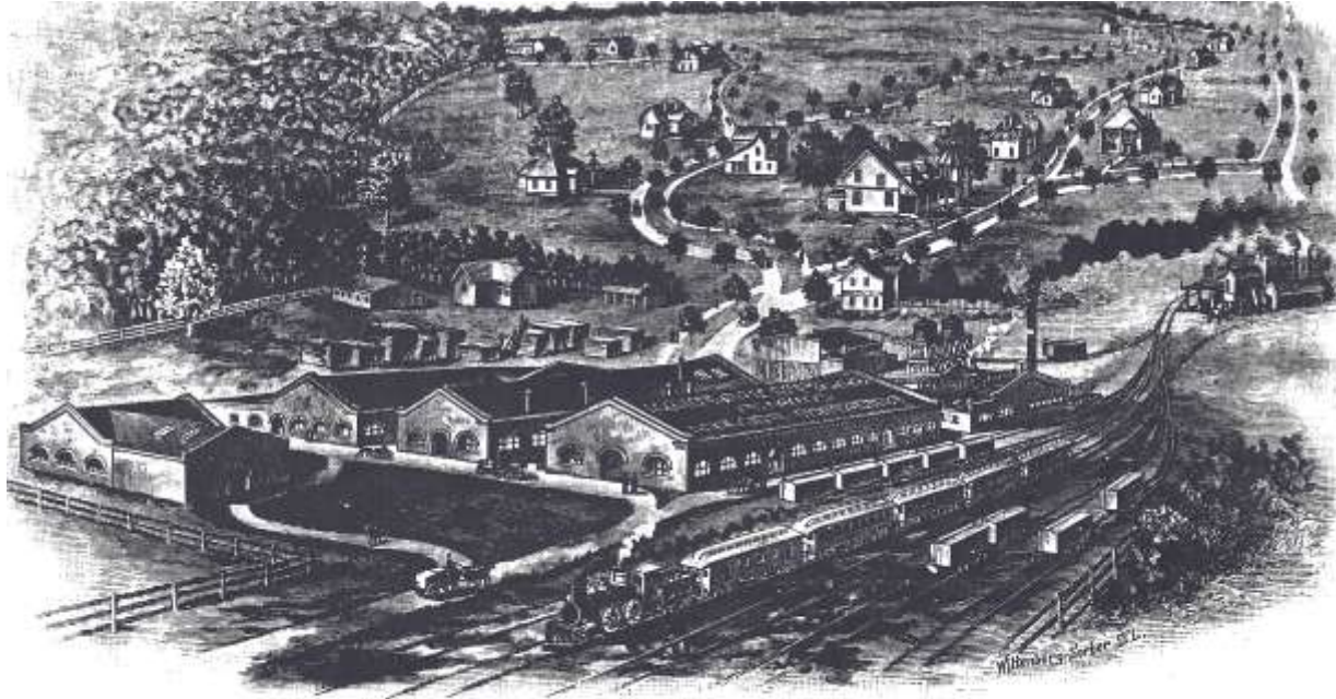
LECLAIRE, ILL., OWNED BY N. O. NELSON MFG. CO.