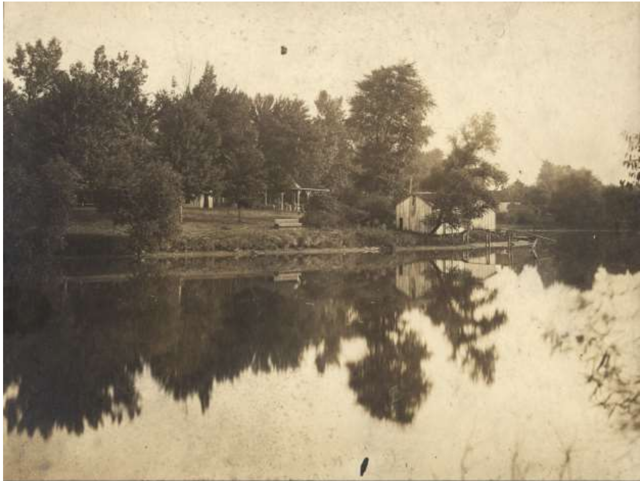
Figure 14: View of Leclaire Lake showing the bandstand and boat house as well as the swimming platform when viewed from the south end of the lake looking north.