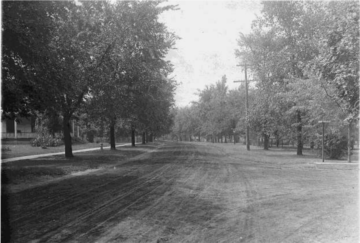
Figure 3: This undated view is looking south on Holyoake from in front of the School House.