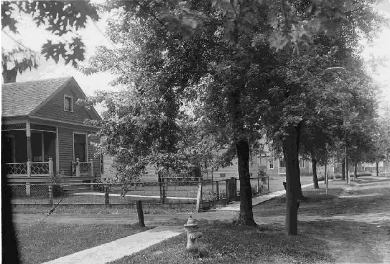
Figure 8: Undated view of Holyoake Road showing the home at 900 Holyoake Road.