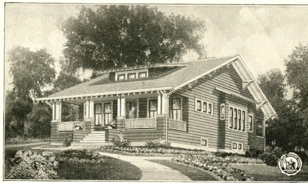
The HAZELTON Honor Price $2,986 00 No. 2025 "Already Cut" and Fitted.

The home at 409 Franklin Ave. is one of several kit homes that can be found in Leclaire. Built in 1920, it is the Hazelton model from Sears, Roebuck & Company, a popular style that was available from 1911 to 1922. Sears had catalog sales of homes from 1908-1942. These houses arrived as a "kit" containing everything needed to build the home (except the foundation), including pre-measured and cut lumber, nails, hinges and shingles. They featured the latest innovations in homebuilding and were very popular in the eastern half of the United States.