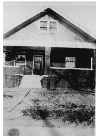
1102 Troy Road is shown here shortly after the house was built (note the plank sidewalk).