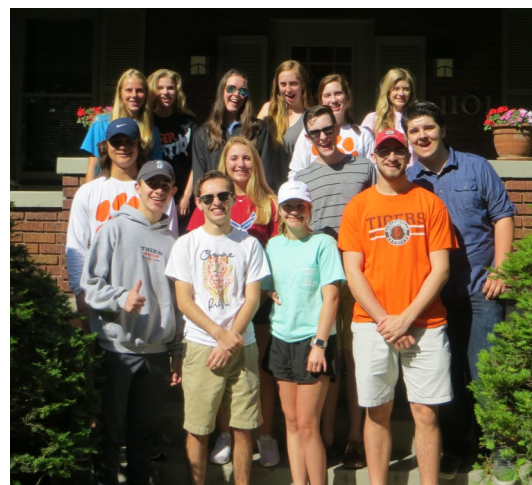
The extraordinary EHS Student Council volunteers.

We are a very active group and are always interested in additional volunteers. Call 618-659-2108 if you are interested in volunteering.