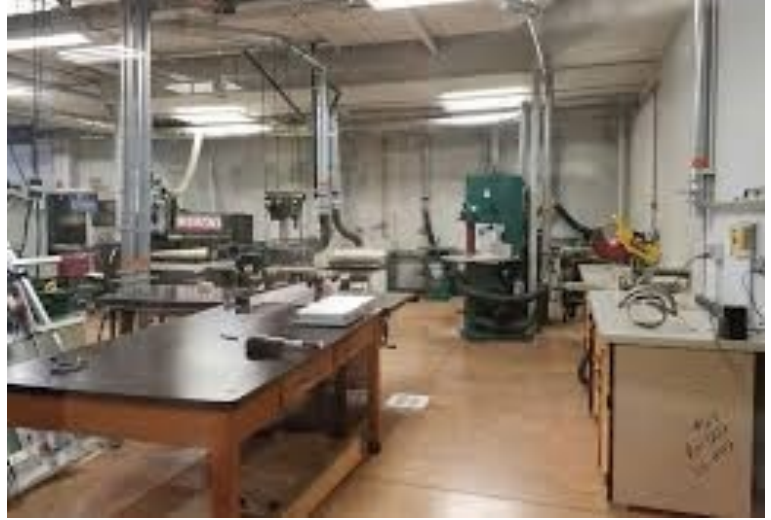
A view of some of the equipment available at the Fab Lab.

Currently, the Fab Lab is host to many entrepreneurs/hobbyists who use the area to design and craft their products. These include professional woodworkers constructing specialty furniture, SIUE students manufacturing struts for cars, robotics club members building robots for competition, artists creating metal sculptures and much more.