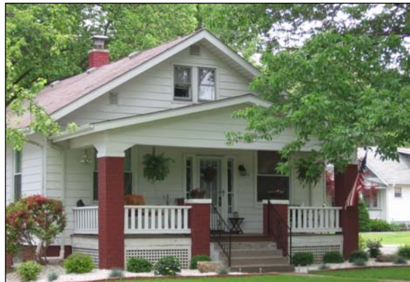
Daliso Rizzoli House 1024 Longfellow Avenue