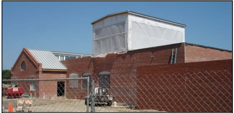
Progress on South Section of Jay Hoffman Center at Nelson